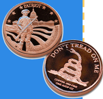
Patriot Second Amendment Medallion